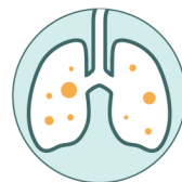
'a'kw'ulhnuh (Difficulty breathing)