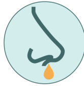
hwel'shum' muqsun (Runny nose)