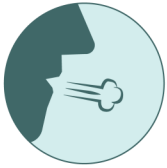
Tl'utl'its' s-hets'um (Shortness of breath)