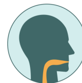
suyum shhwuthqun (Sore throat)